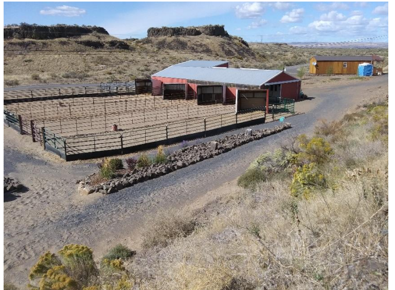
The hands-on facility includes an in-door barn with workstations including stocks, three stalls, office and tack rooms. Hot and cold water is available for washing/sanitation.