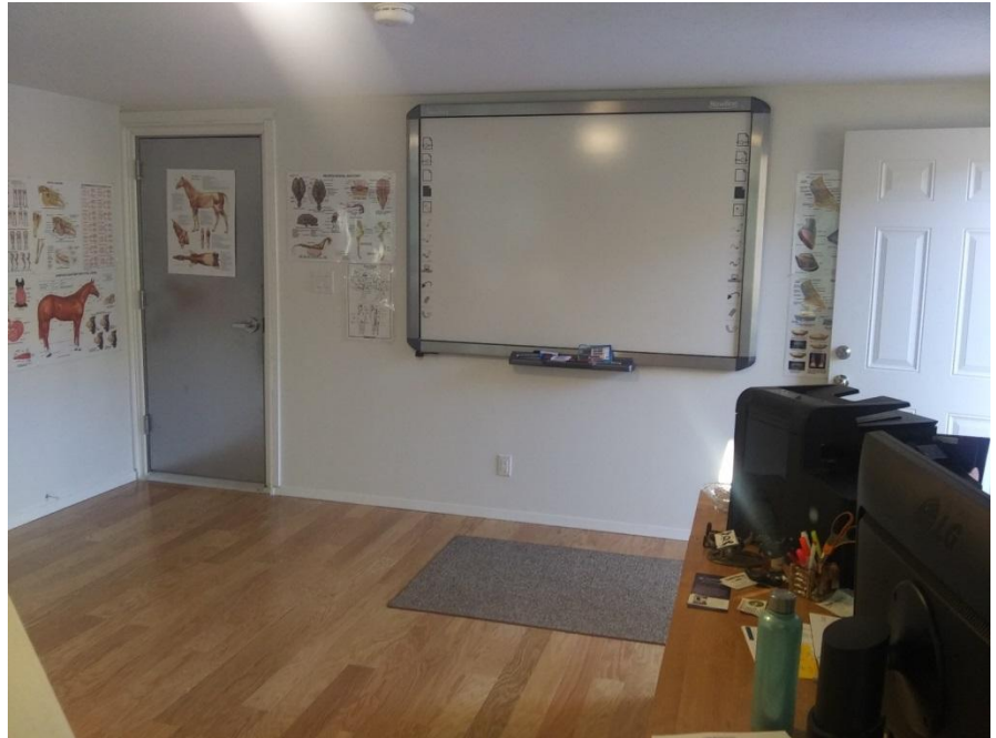
White Board for lecture