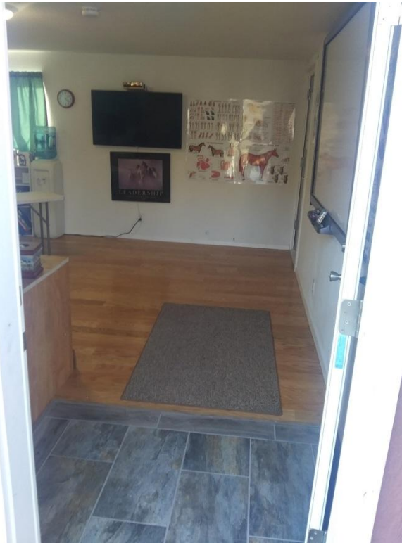
Entrance From Outside