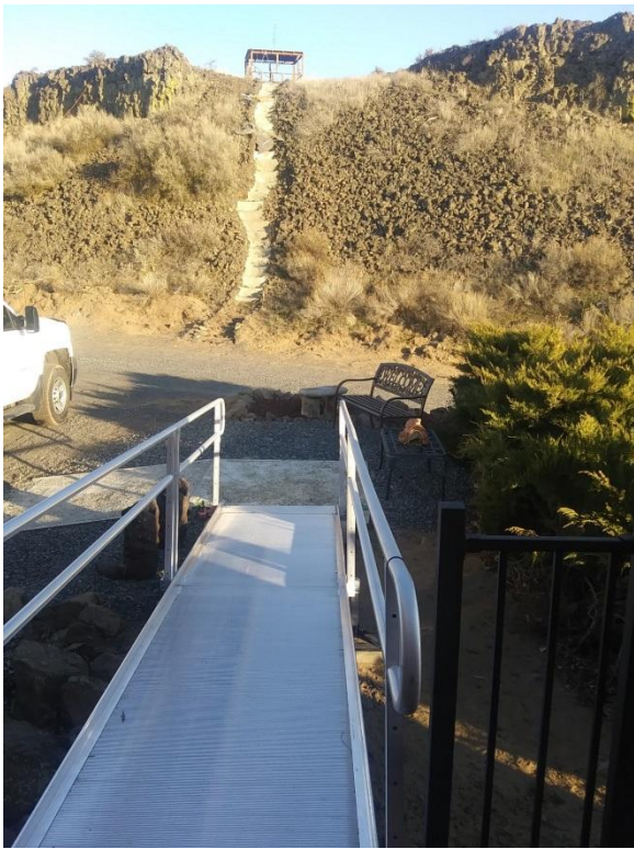
Wheel chair excsible entrance to lecture room.