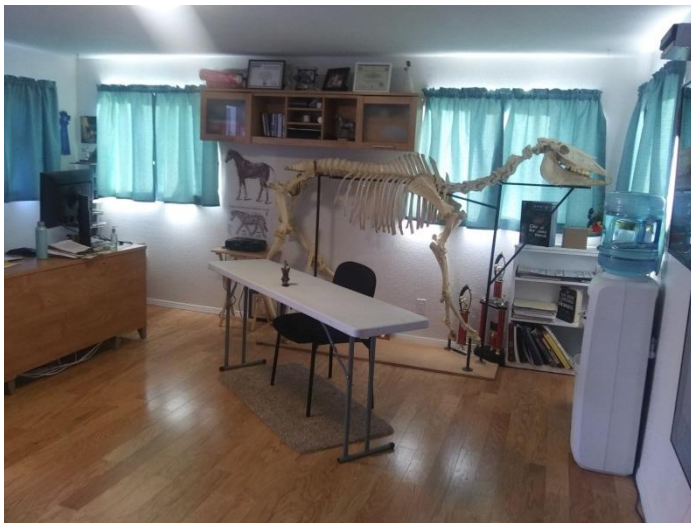
Full scale –real-equine bones- skeletal display