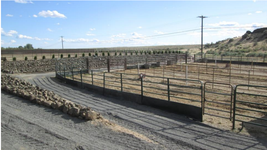
4 dry lot pens, South campus 143'x140' out-door arena near barn.