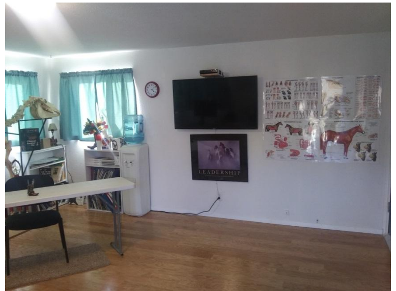
TV for viewing videos